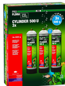
JBL PROFLORA CO2 CYLINDER 500 U 3x 500g disposable CO2 storage cylinder (value pack of 3)