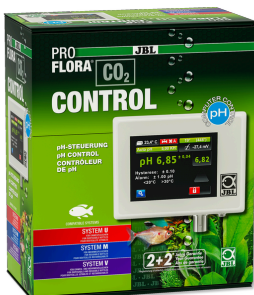
JBL PROFLORA CO2 CONTROL Measurement and control computer to regulate CO2 & pH