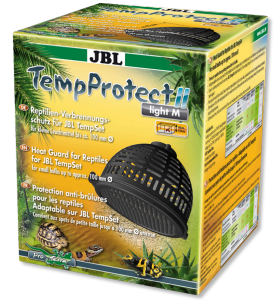
JBL TempProtect II light Reptile thermal burn protection for JBL TempSet items