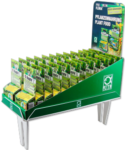
JBL tray 381 x 186 x 30mm