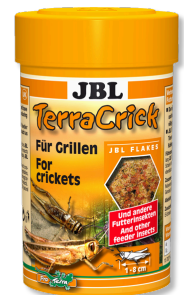
JBL TerraCrick Complete food for feeder insects