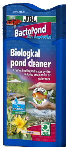
JBL BactoPond Bacteria for biological purification of the pond