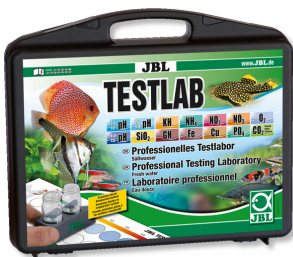
JBL Testlab Test case with 13 tests f. freshwater analysis Testlab