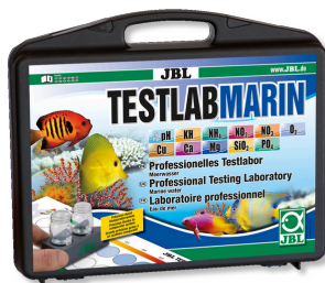
JBL Testlab Marin Professional test case for the analysis of saltwater