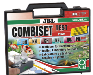
JBL Test Combi Set Pond The most important water tests for garden ponds