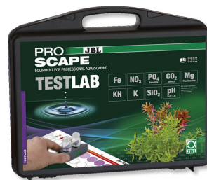
JBL Testlab ProScope Test case for water analysis in plant aquariums