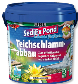
JBL SediEx Pond Bacteria and active oxygen for the breakdown of sludge