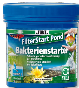
JBL FilterStart Pond Bacteria starter for pond filters