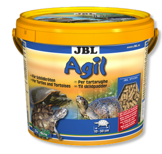
JBL Agil Main foodsticks for turtles 10 – 50 cm in size