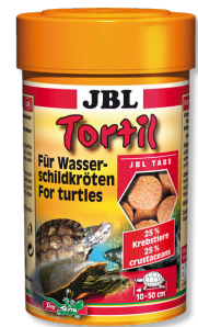
JBL Tortil Food tablets for turtles and pond terrapins