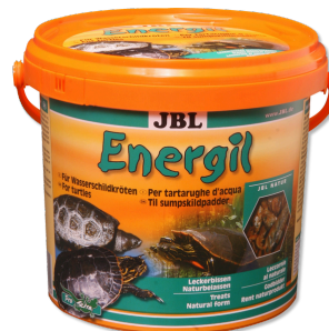
JBL Energil Main food for turtles and pond terrapins