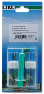
JBL component set for water tests