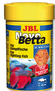
JBL NovoBetta Complete food for labyrinth fish, e.g. fighting fish