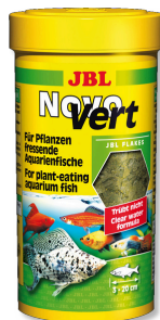
JBL NovoVert Main food flakes for plant-eating fish