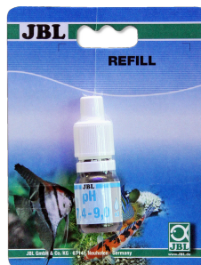
JBL pH Test 7.4-9.0 pH test in aquariums and ponds in the range 7.4-9.0