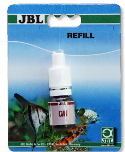
JBL GH Test Quick test to determine the total hardness