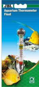
JBL Aquarium Thermometer Float Aquarium thermometer