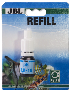
JBL pH Test 3.0-10.0 Quick test to determine the acidity