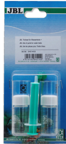
JBL component set for water tests