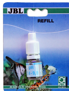
JBL pH Test 7.4-9.0 pH test in aquariums and ponds in the range 7.4-9.0