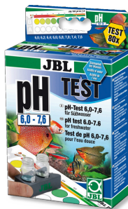
JBL pH Test 6.0-7.6 pH test for freshwater aquariums in the range 6.0-7.6