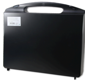
JBL Testlab empty + inserts