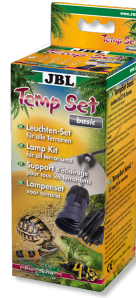
JBL TempSet basic Installation kit for lamps in terrariums