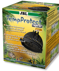
JBL TempProtect light Reptile thermal burn protection for JBL TempSets