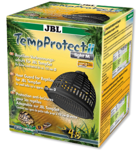
JBL TempProtect II light Reptile thermal burn protection for JBL TempSet items