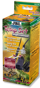
JBL TempSet angle+ connect Installation kit for lamps in terrariums