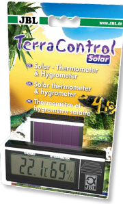
JBL TerraControl Solar Solar-powered thermometer + hygrometer for terrariums