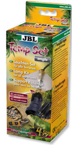
JBL TempSet angle Installation kit for lamps in terrariums