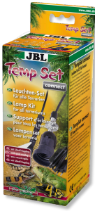
JBL TempSet connect Installation kit with connector