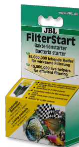
JBL FilterStart Bacteria for the activation of filters