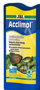
JBL Acclimol Water conditioner for acclimatisation