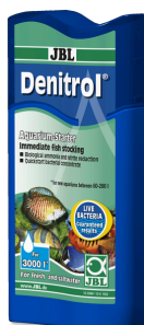
JBL Denitrol Bacteria starter for adding aquarium fish