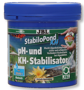
JBL StabiloPond KH pH balancer for garden ponds