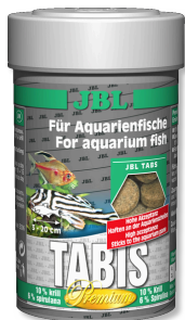
JBL Tabis Premium food tablets for freshwater and marine fish