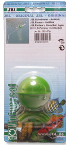
JBL Floater + AntiKink Floater with anti-kink protection for PondOxi-Set