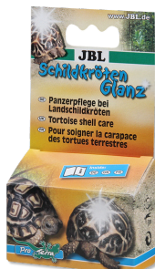
JBL Tortoise shell care Shell care for tortoises