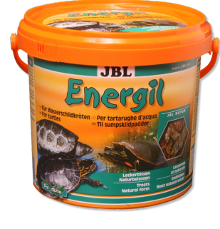
JBL Energil Main food for turtles and pond terrapins