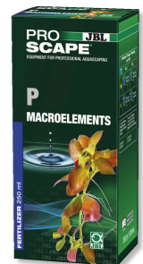
JBL PROSCAPE P MACROELEMENTS Phosphorus plant fertiliser for aquascaping