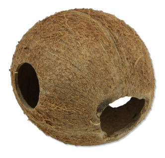
JBL Cocos Cava Coconut cave for aquariums and terrariums