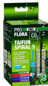
JBL PROFLORA CO2 TAIFUN SPIRAL 5 Expandable CO2 reactor for freshwater aquariums