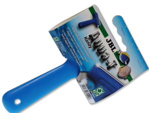
JBL Aqua-T Handy Glass pane cleaner with stainless steel blade