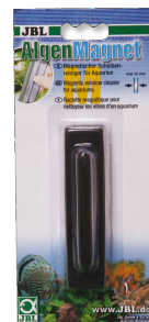
JBL Algae Magnet Magnetic glass cleaner for aquarium panes