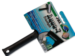
JBL Aqua-T Triumph Glass pane cleaner with spare blades and rubber scraper