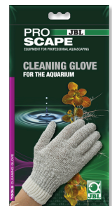
JBL PROSCAPE CLEANING GLOVE Aquarium cleaning glove