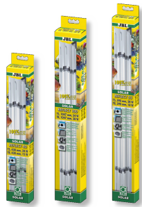
JBL SOLAR Reflect T5/ T8 - 895-1500 mm Reflector panel for fluorescent tube