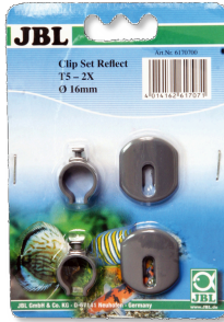
JBL SOLAR REFLECT Clip Set Holder for fluorescent tubes