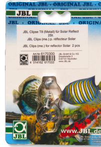
JBL Clips T5/T8 (Metal) Metal holder für fluorescent tubes