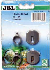
JBL SOLAR REFLECT Clip Set Holder for fluorescent tubes