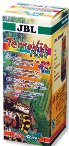
JBL TerraVit fluid Vitamins and trace elements for terrarium animals