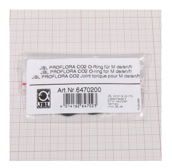
JBL PROFLORA CO2 Oring for m