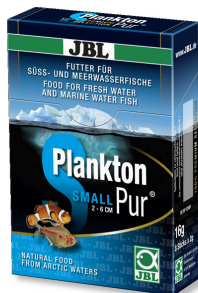
JBL PlanktonPur SMALL