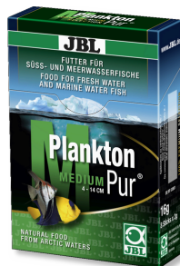
JBL PlanktonPur MEDIUM