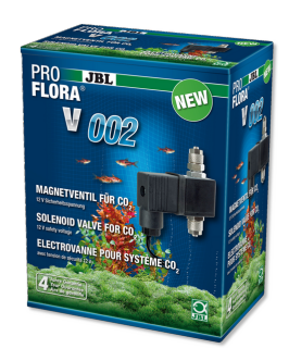
JBL PROFLORA v002 Noiseless solenoid valve