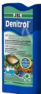
JBL Denitrol Bacteria starter for adding aquarium fish