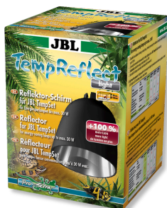
JBL TempReflect light Reflector screen for energy- saving lamps