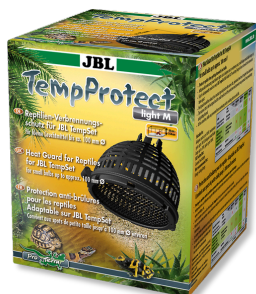
JBL TempProtect light Reptile thermal burn protection for JBL TempSets