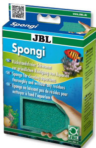
JBL Spongi Cleaning sponge for aquariums and terrariums