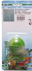
JBL Floater + AntiKink Floater with anti-kink protection for PondOxi-Set