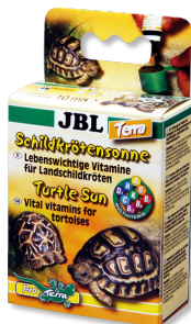
JBL Tortoise Sun Terra Vitamins for tortoises