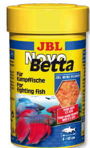
JBL NovoBetta Complete food for labyrinth fish, e.g. fighting fish