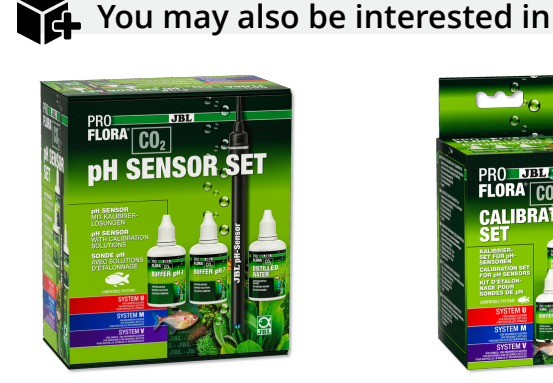
JBL PROFLORA CO2 pH SENSOR SET pH electrode, labor. guality for almost all pH devices