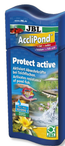
JBL AccliPond Water conditioner for ponds