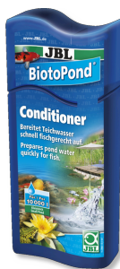
JBL BiotoPond Water conditioner for ponds