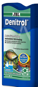
JBL Denitrol Bacteria starter for adding aquarium fish