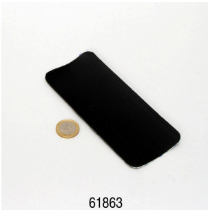
JBL Floaty Pad