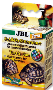
JBL Tortoise Sun Terra Vitamins for tortoises