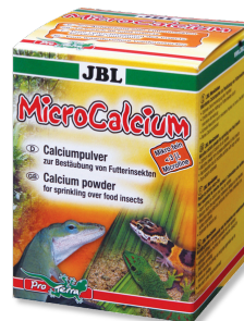
JBL MicroCalcium Mineral supplementary food for all reptiles