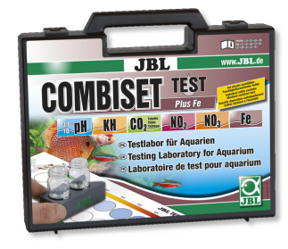
JBL Test Combi Set plus Fe Test case with most important water tests + iron test

You can find a complete overview here: https://www.jbl.de/gr/25370