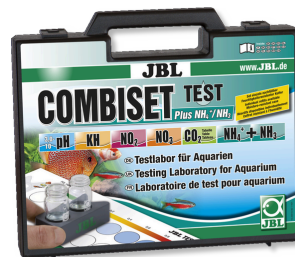
JBL Test Combi Set Plus NH4 Test case with most important water tests + NH4 test