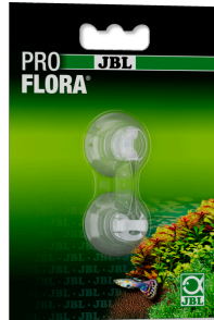
JBL suction cup with clip, 6 mm

Transp. suction cups + clips for objects 6mm approx.