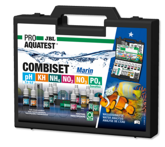
JBL PROAQUATEST COMBISET Marin

Professional test case for marine water analysis