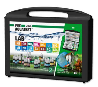
JBL PROAQUATEST LAB Test case with 13 water tests

Test case with most important water tests + iron test