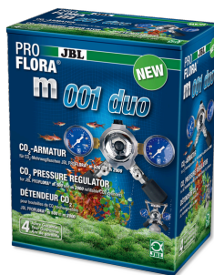
JBL PROFLORA m001 duo Fitting to reduce pressure for 2 CO2 diffusers