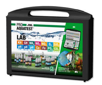
JBL PROAQUATEST LAB

Test case with most important water tests + NH4 test