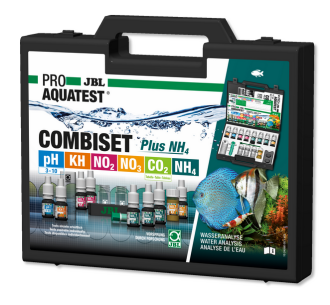
JBL PROAQUATEST COMBISET Plus NH4

Test case with most important water tests + iron test