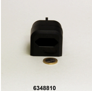
JBL adapter UK for all flat-pin plugs