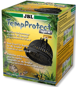
JBL TempProtect light Reptile thermal burn protection for JBL TempSets