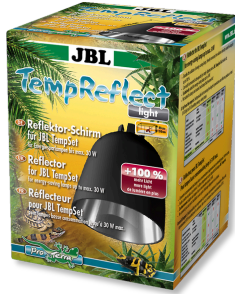
JBL TempReflect light Reflector screen for energy-saving lamps