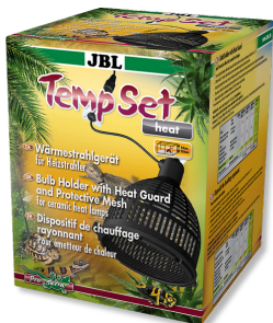
JBL TempSet Heat Install. kit with ceramic bulb holder for heat radiator